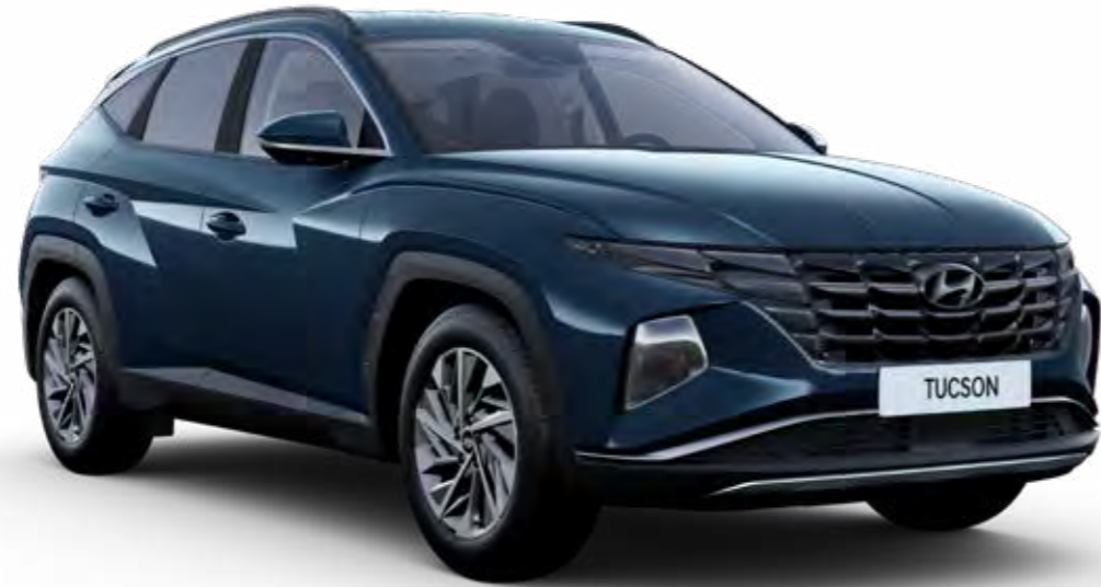
Car shown: TUCSON Premium in Dark Teal Metallic.