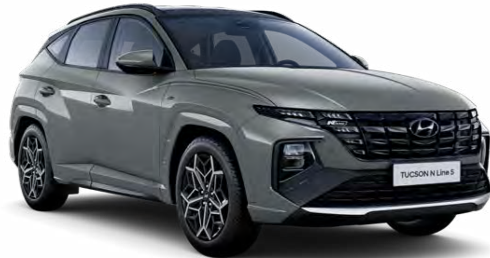
Car shown: TUCSON N Line S in Shadow Grey Solid.