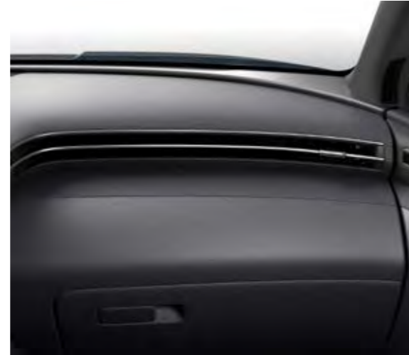
Black Dashboard Standard across all trim levels.