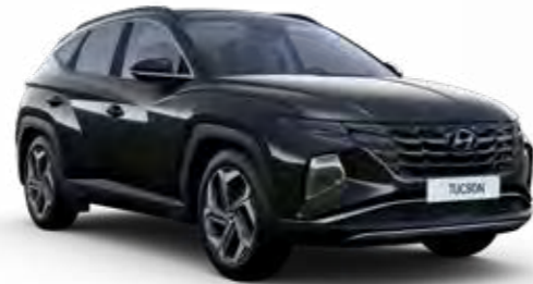
Dark Knight Grey Pearl*