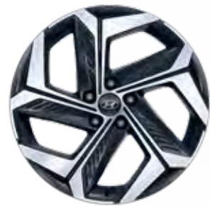
19" Alloy Wheels.