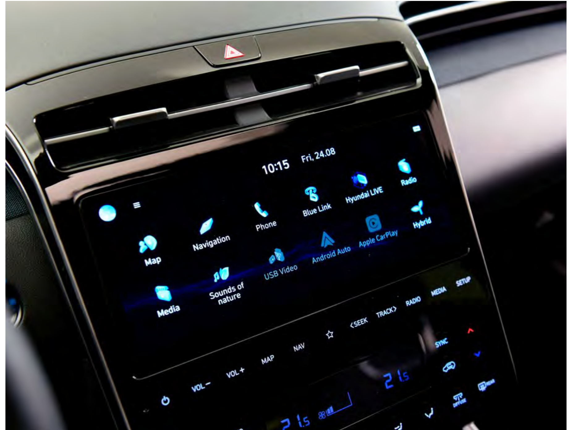
10.25" touchscreen audio visual navigation standard across all trim levels.