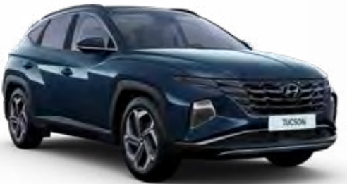
Dark Teal Metallic* Not available on N Line or N Line S.