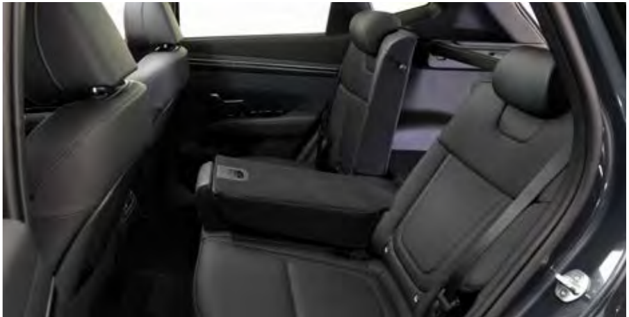
Split folding rear 40:20:40 seats standard across all trims.