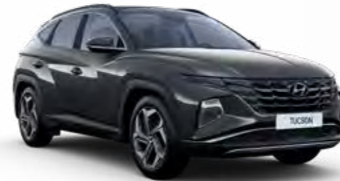
Amazon Grey Metallic* Not available on N Line or N Line S.