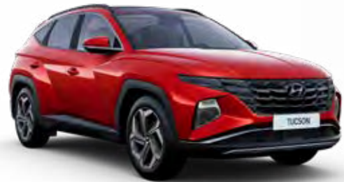
Engine Red Solid

Choose the right colour for you from our vibrant colour palette.