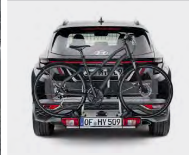
Towbar Mounted Bike Carrier.