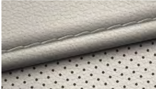
Moss Grey Leather Optional on Ultimate trim.