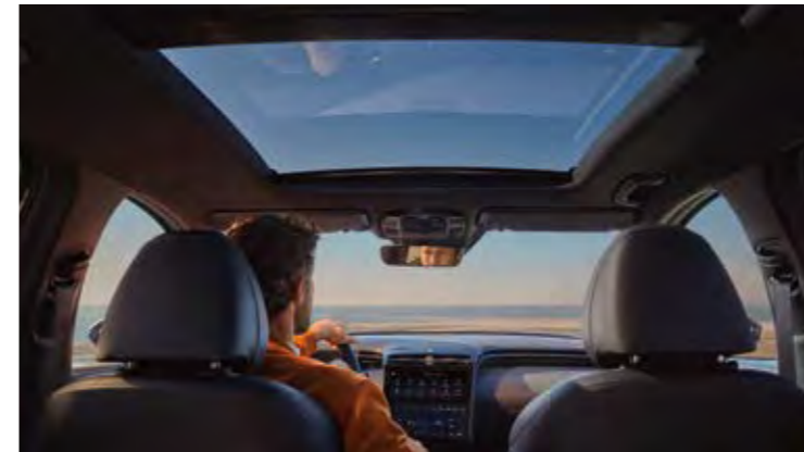
Panoramic glass sunroof standard on Ultimate trim.