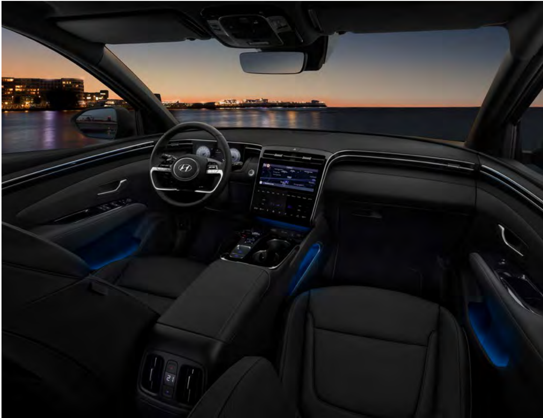
Car shown: TUCSON Hybrid Ultimate. Image shown is not to UK Specification.