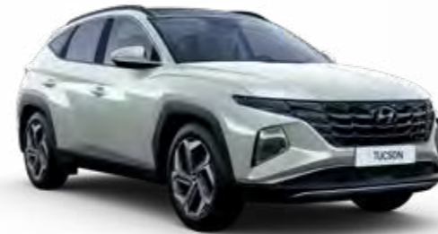
Serenity White Pearl*