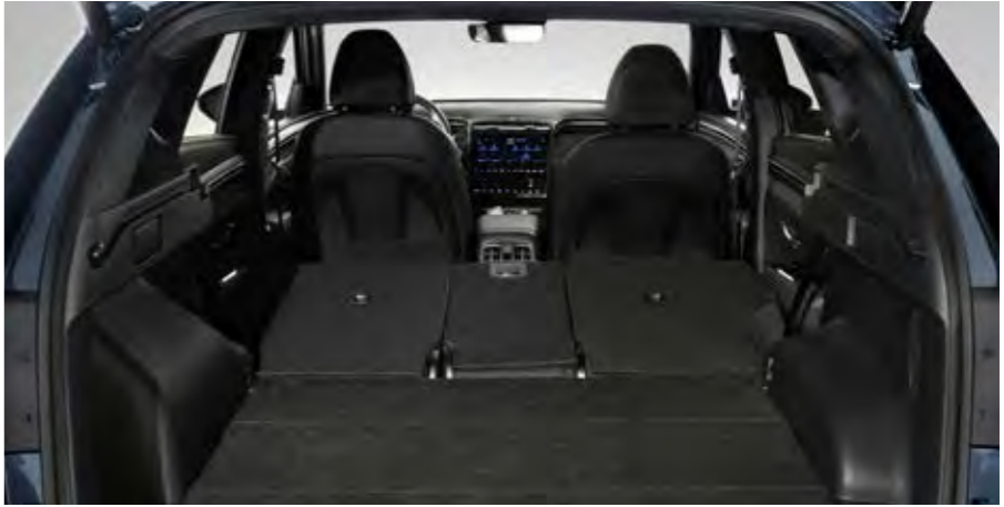
Remote folding rear seat function. Standard on Ultimate trim.