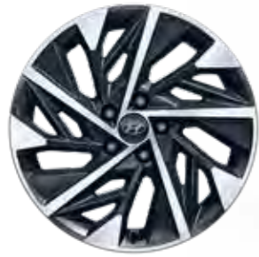
18" Alloy Wheels.