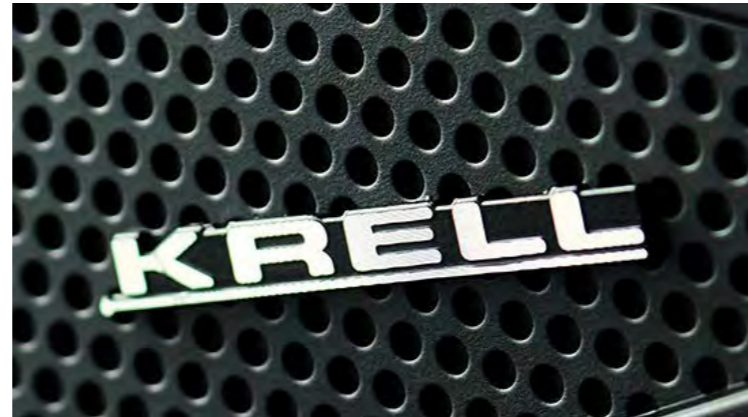
*KRELL premium audio standard on N Line S, Premium and Ultimate trims.

The TUCSON offers connectivity that is second to none. Front and centre, the 10.25" Supervision Cluster and 10.25" touchscreen Audio Visual Navigation units give full control of on board systems at your fingertips. Mobile connectivity allows multiple handsets to be connected via Bluetooth®. Smart Voice Interaction gives you integrated vehicle control, and wireless smartphone charging** means you're cable-free. Our on board KRELL* sound system features eight custom speakers to provide an immersive audio experience. Bluelink® connected car services includes Last Mile Navigation and a new user profile feature. Users can locate their vehicle or view vehicle attributes like fuel level, via the Bluelink® app.