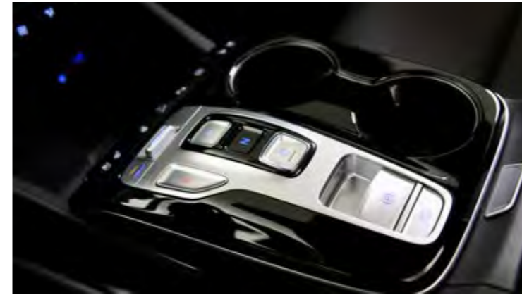
Shift by wire standard on all Hybrid trims.