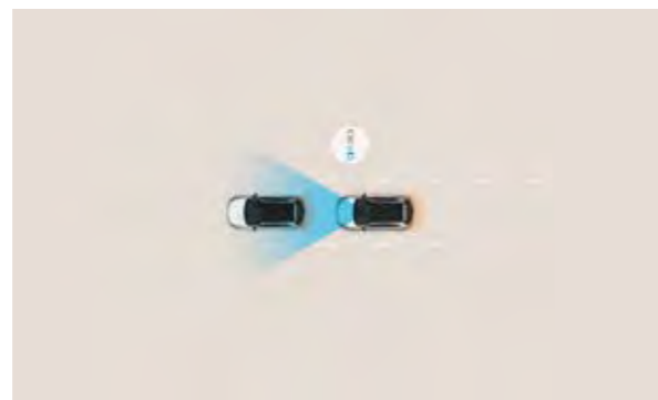
Forward Collision Avoidance (FCA): On detecting the risk of a collision ahead with a vehicle, pedestrian or cyclist, the driver is alerted to the danger, and if necessary, brakes are automatically applied to help prevent a frontal collision.