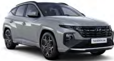
Shadow Grey Solid Available on N Line and N Line S only.