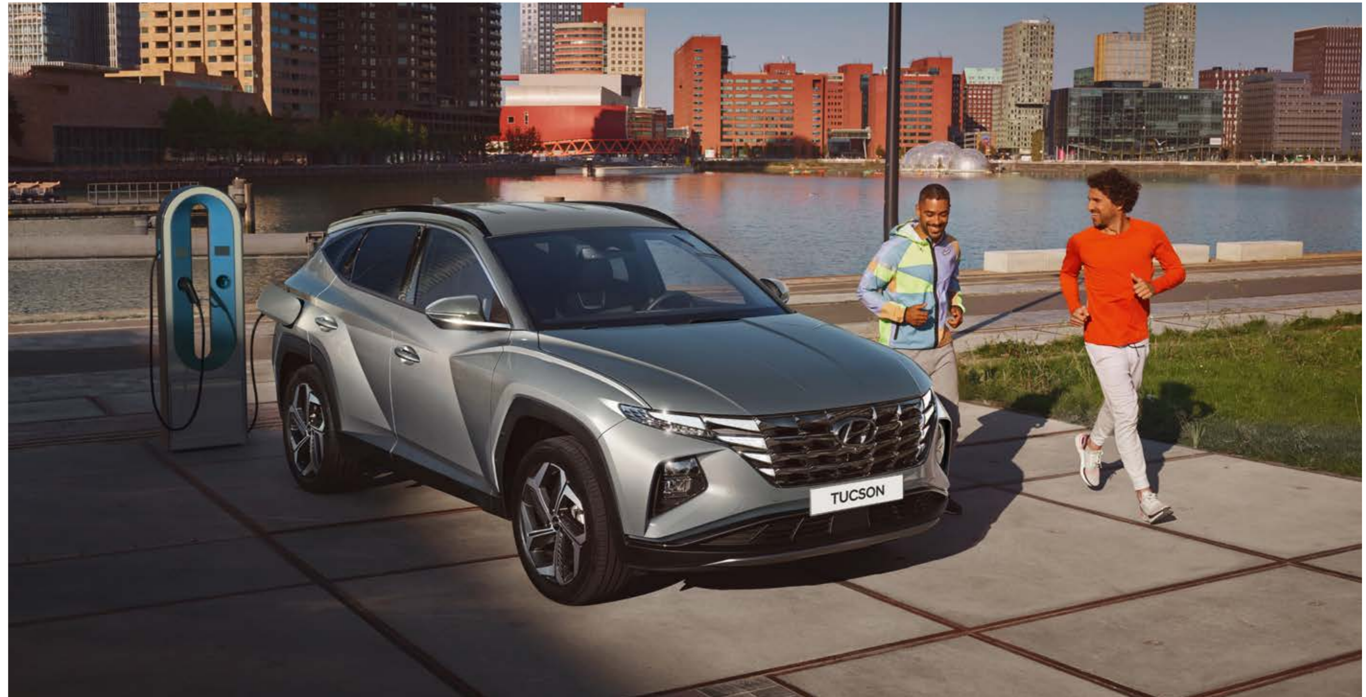
Car shown: TUCSON Plug-in Hybrid Premium in Shimmering Silver Metallic. Car shown is not to UK Specification.

*Estimated, subject to WLTP homologation.