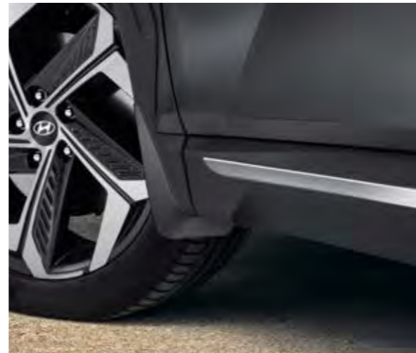
Front and Rear Mudguards.