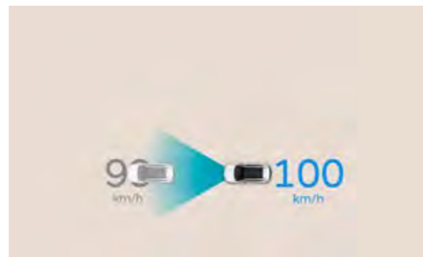
Smart Cruise Control (SCC): Automatically takes road features into account and adjusts your speed to maintain a safe distance from the vehicle in front.

Safety starts outside the vehicle. With a complete safety package*, the TUCSON's Collision Avoidance systems warn of hazards on all sides, including blind spots, to protect you and your passengers. The new Safe Exit Warning (SEW) function alerts occupants if there is oncoming traffic when they attempt to step out of the car.