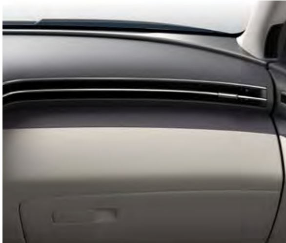
Black and Moss Grey Dashboard Part of the Moss Grey leather pack, optional on Ultimate trim.