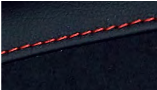
Black Leather & Suede Standard on N Line and N Line S trims.