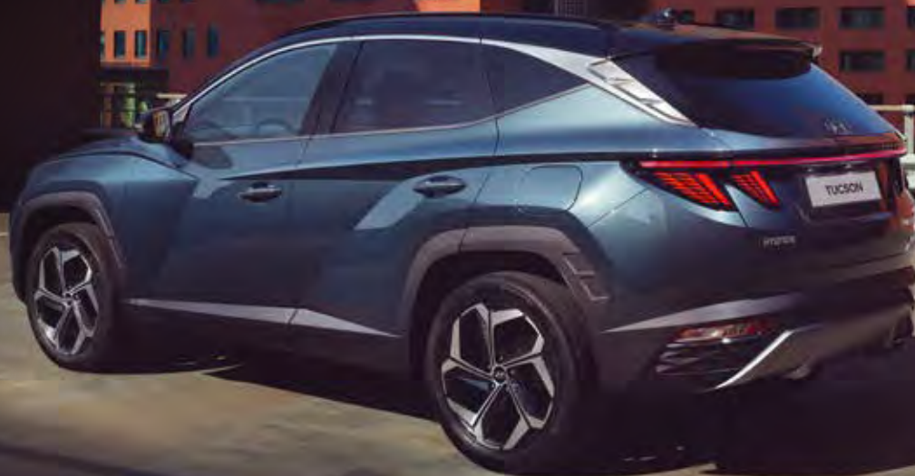
Car shown: TUCSON Hybrid Premium in Dark Teal Metallic with optional two-tone roof. Car shown on front cover: TUCSON Hybrid Ultimate in Dark Teal Metallic. Cars shown not to UK specification.

In line with our policy of continual product improvement Hyundai Motor UK Ltd reserves the right to make changes at any time, without notice, to prices, colours, material, design, shape, specifications and models, and to discontinue items. For the latest details, please consult your Hyundai Retailer