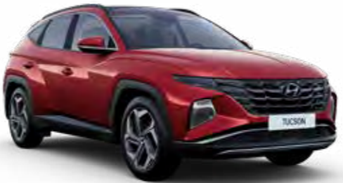
Sunset Red Pearl*