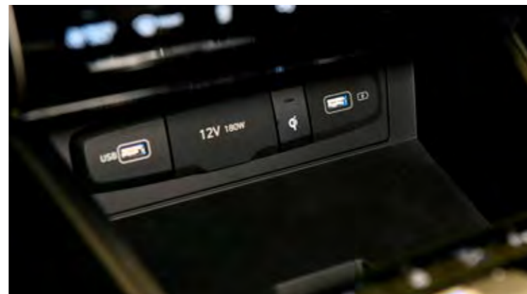
**Wireless phone charging pad not available on SE Connect trim.