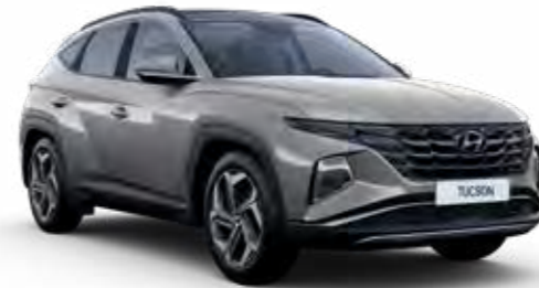
Shimmering Silver Metallic*