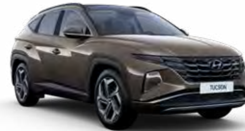
Silky Bronze Metallic* Not available on N Line or N Line S.