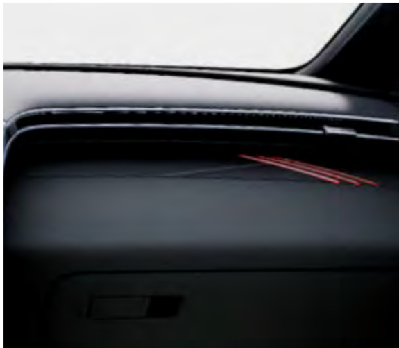
N Line Dashboard Standard on N Line and N Line S trim.