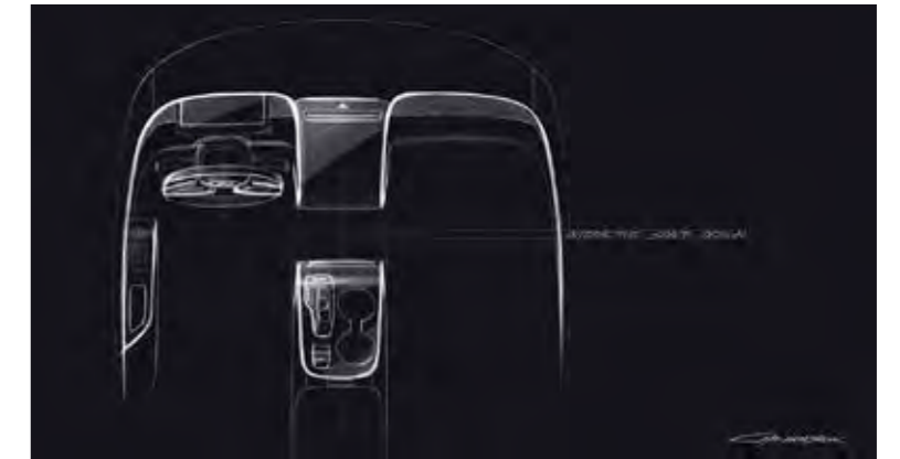
Original design sketches.

Elegance, comfort and style to put you in the right space.