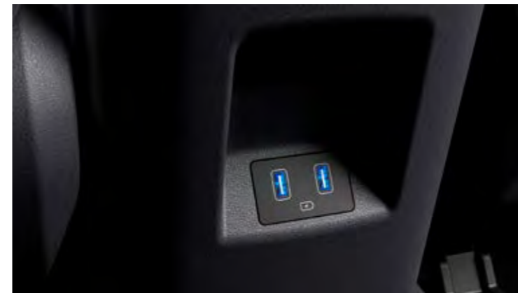
USB charger connections standard on all trims.