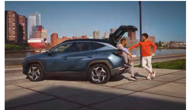
Car shown: TUCSON Hybrid Premium in Dark Teal Metallic. Car shown is not to UK Specification.

Dynamic design combined with advanced technology for the drive of tomorrow, today.