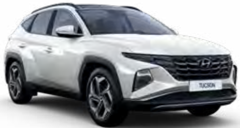
Atlas White Solid