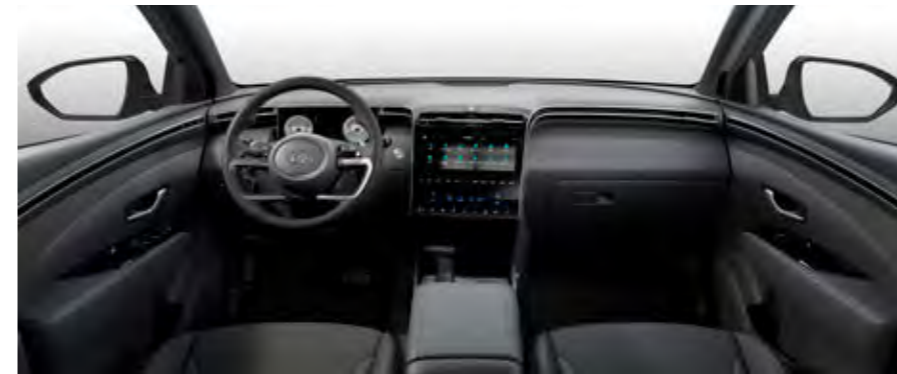
DCT Transmission: Available on 48V Mild Hybrid models only.