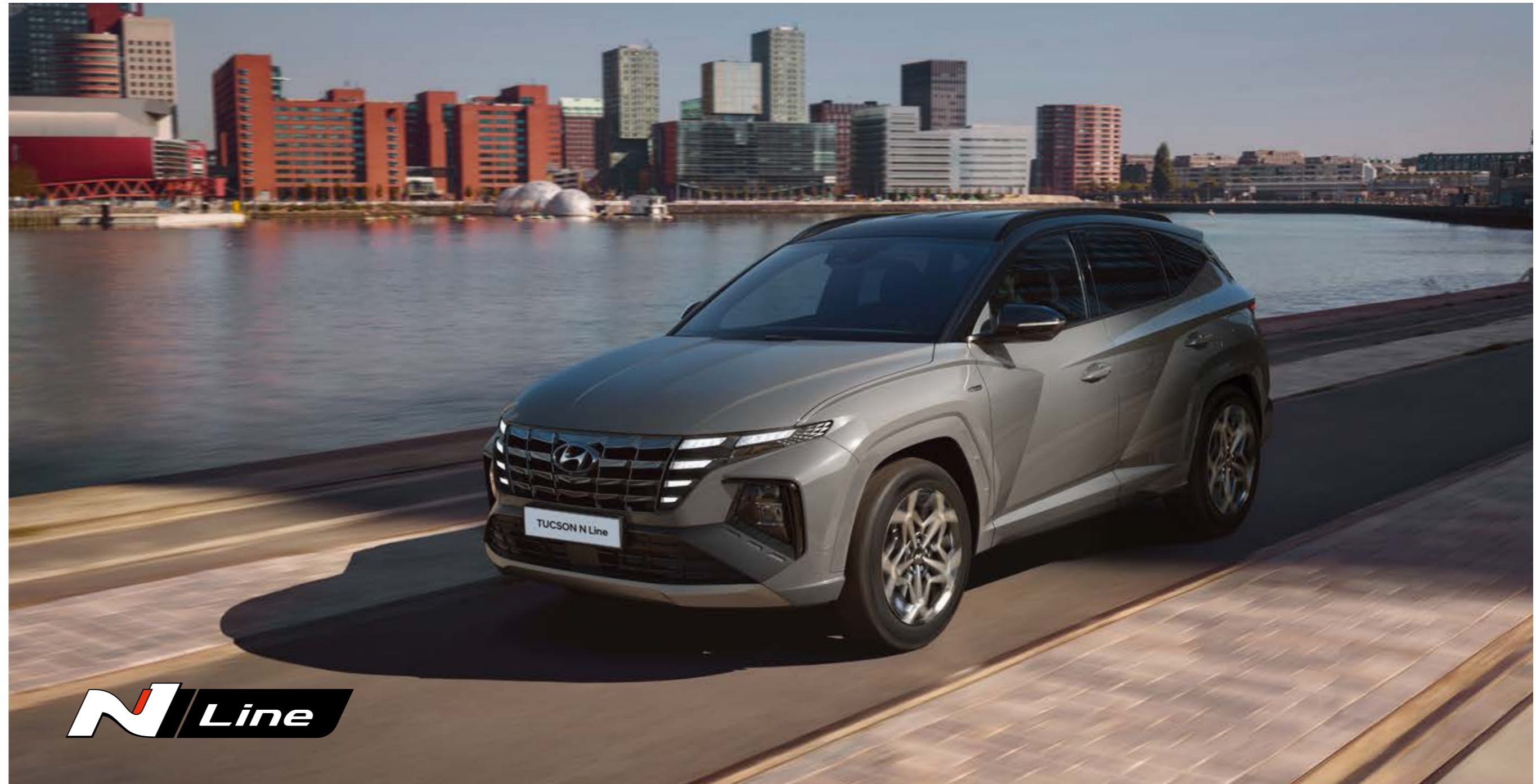
Car shown: TUCSON N Line in Shadow Grey Solid with optional Phantom Black Pearl two-tone roof. Car shown is not to UK Specification.

The TUCSON N Line combines style and enhanced sportiness. 19" alloy wheels feature distinctive parametric patterns. Black headlamp bezels compliment the dark chrome-effect grille. The body-coloured wheel arch mouldings and twin-tip sports exhaust complete the N Line look. Our designers have continued to set the pace inside. Upholstery that features a striking combination of suede and leather is enhanced by bold red stitching. The stylish N Line-branded steering wheel and alloy pedals further add to the sporting persona.