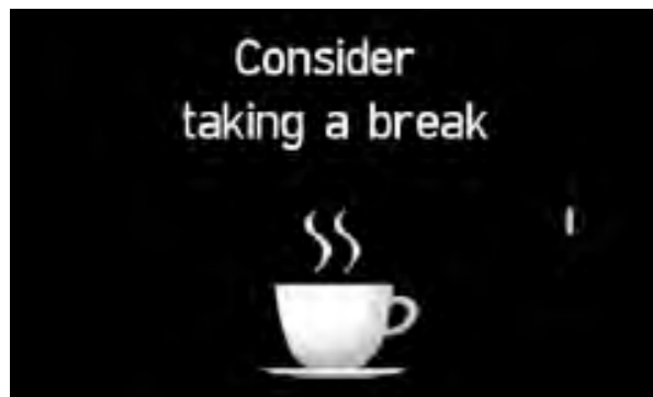
Driver Attention Warning (DAW): When a pattern of fatigue or distraction is identified, the system gets your attention with an alert and pop-up message suggesting a break.

With upgraded Smart Sense safety systems for all-round protection, safety is more than a priority.