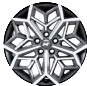
19" Alloy Wheels.