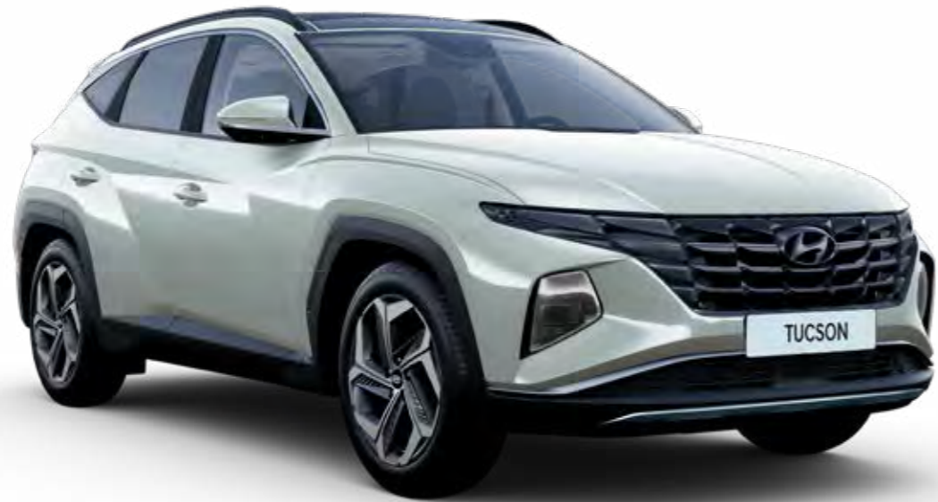
Car shown: TUCSON Hybrid Ultimate in Serenity White Pearl.