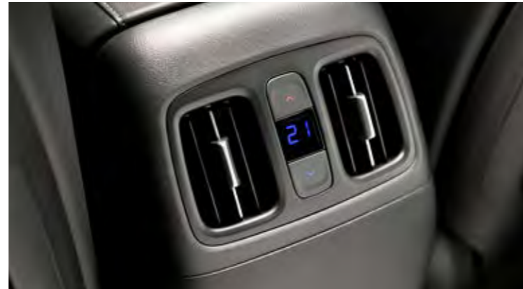
Three Zone climate control standard on Ultimate trim.