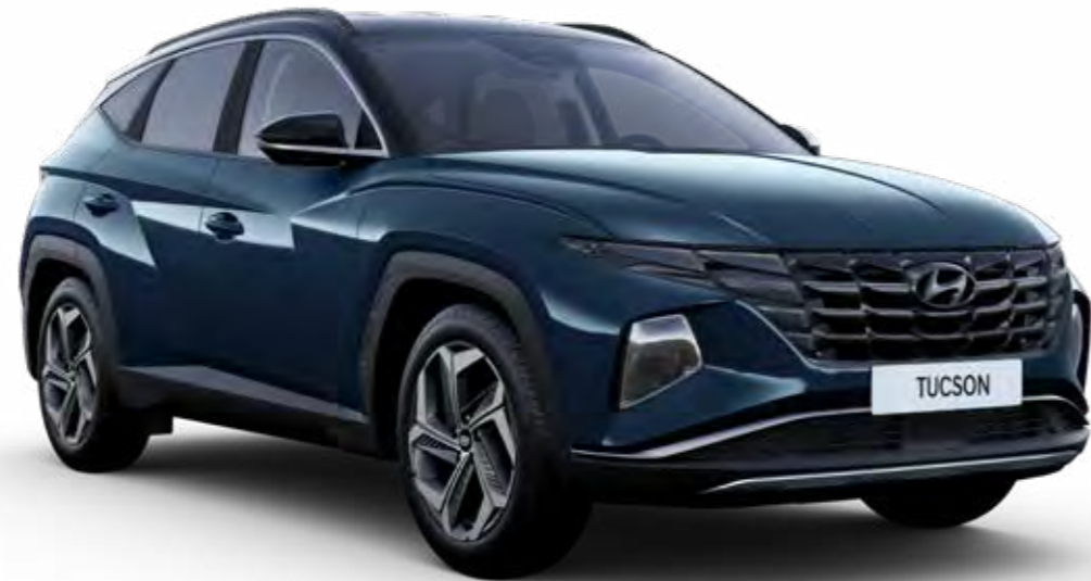
Car shown: TUCSON Hybrid Premium in Dark Teal Metallic with Black two-tone roof.