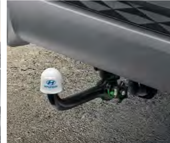
Fixed and Detachable towbar.