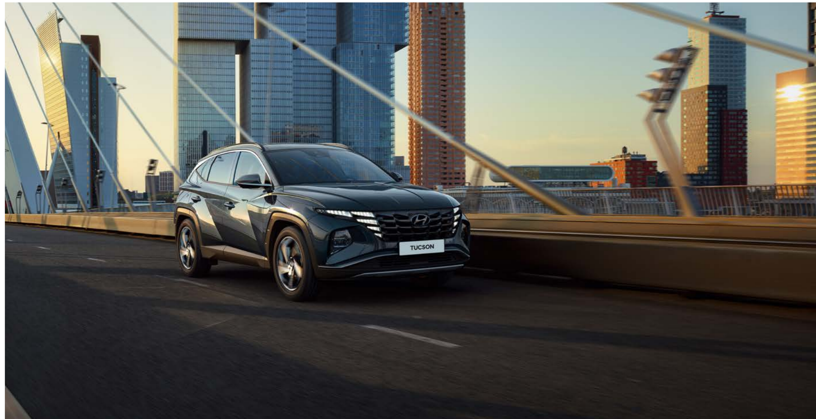
Car shown: TUCSON Hybrid Ultimate in Dark Teal Metallic. Car shown is not to UK Specification.

Outstanding progressive design doesn't just happen; it's crafted from the drawing board to the road. Since its launch in 2004, the TUCSON has continued to evolve in design and build, to reach this refined fourth generation model.