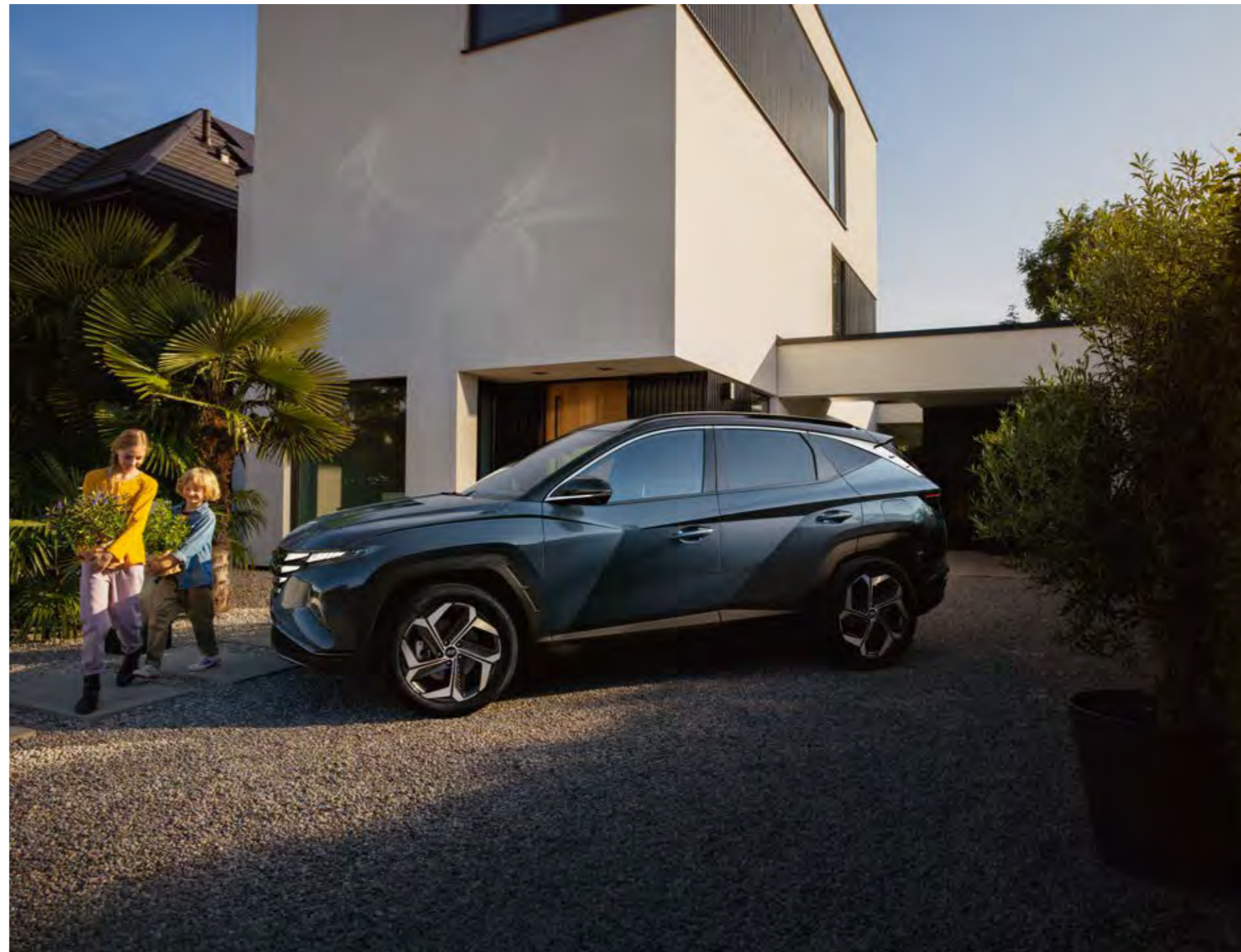
Car shown: TUCSON Hybrid Premium in Dark Teal Metallic with optional two-tone roof and interior colour pack. Car shown is not to UK specification.