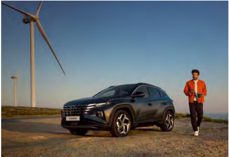
Car shown: TUCSON Hybrid Premium in Dark Teal Metallic. Car shown is not to UK Specification.

The TUCSON is about adventures together, plans made and plans delivered. A choice of powerful, efficient engines and technology that supports you. Advanced safety systems protect you beyond the bodywork, with sensors and cameras that alert you to danger. A fully connected in-car information system syncs with your smartphone.