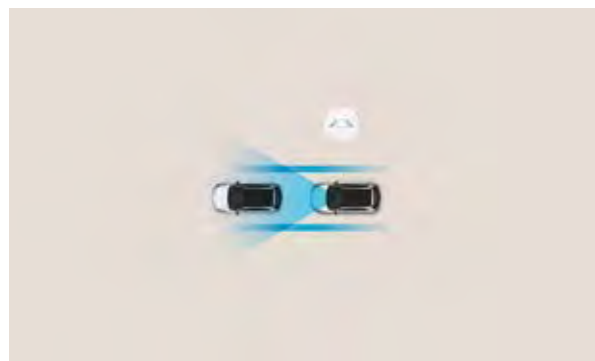
Lane Follow Assist (LFA): LFA helps prevent accidental lane departure and keeps your vehicle safely centered within the lane. Using a forward camera to recognise the intended lane, LFA will automatically provide corrective steering input to help maintain the centre path. This not only detects road lines but also the road edge.