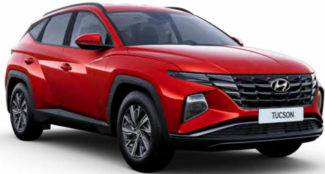
Car shown: TUCSON SE Connect in Engine Red Solid.